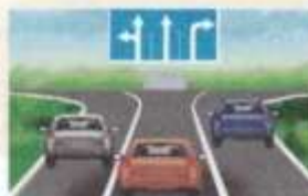
left; straight; right