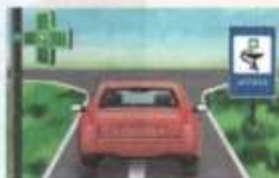
on the left; on the right